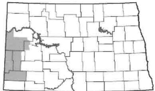
North Dakota Bighorn Sheep Hunting Units